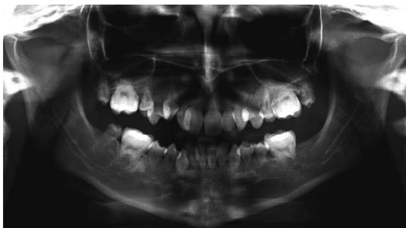
Figure 4. Panoramic radiograph of a 17-year-old shows dental crowding, malocclusion, pulp chamber obliteration, and severe shortening of the roots of all permanent teeth. The patient is a 15-year neuroblastoma survivor.

Because of exposure to ionizing radiation, the developing craniofacial complex may exhibit malocclusion with a skeletal etiology. 18 The orthodontic problems may be compounded by dental anomalies (tooth agenesis, microdontia). Often in teen years, these patients and their parents may desire orthodontic treatment. However, the caries risk because of xerostomia and enamel hypoplasia may prevent implementation of an ideal orthodontic treatment plan. If the teeth have blunted roots, orthodontic treatment is further limited as orthodontic movement of teeth can further reduce root length and lead to unfavorable crown-root ratios. The use of light orthodontic forces and compromised results should be discussed with the patient and parents. 39 Figure 4 shows dental crowding, malocclusion, pulp chamber obliteration, and severe shortening of the roots of all permanent teeth.