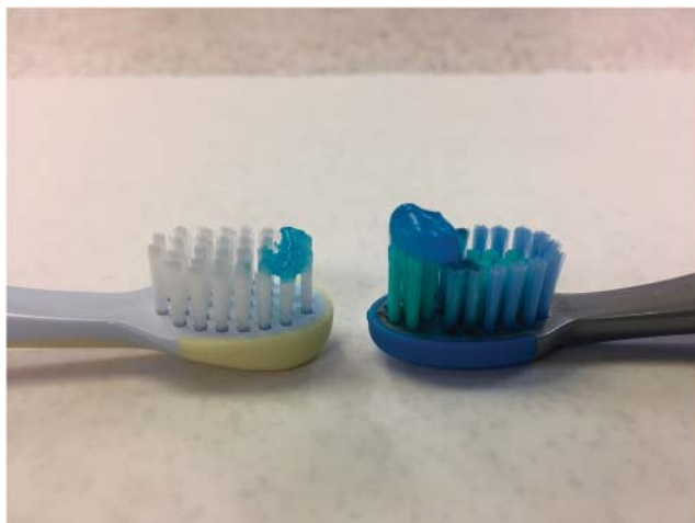
Figure 1. A smear of fluoridated toothpaste (left) is recommended for children younger than 3 years, whereas a pea-size amount of toothpaste (right) is recommended for children 3-6 years.

Fluoride is caries preventive. 11 Over-the-counter fluoridated toothpaste and mouthrinses with a low concentration of fluoride (900-1,100 ppm) can be used at home. 11 Professional application of fluoride in the form of fluoride varnish, fluoride gel, or fluoride foam deliver much higher concentrations of fluoride (12,300-22,600 ppm) and are administered in the