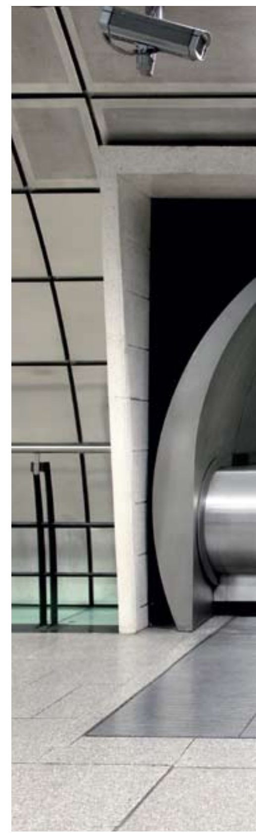
PLANNING FOR THE FUTURE: GRATTON

Many of the ways of working that we have taken for granted for 20 years are disappearing — working from nine-to-five, aligning with only one company, spending time with