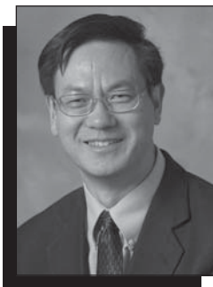
Zhong Lin Wang