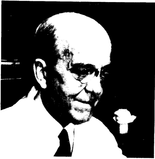
Oswald T. Avery