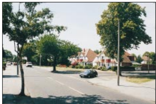
Photograph 37.1: A typical priority junction.

Features of these junction types can sometimes be combined with advantage. For example, in some circumstances, a signal-controlled roundabout can have advantages over either a roundabout or a conventional signal layout. The overall network strategy may also influence the choice of junction type, for example, if positive management or control of traffic is desirable. Figure 37.1 gives an approximate guide to the magnitudes of major and minor road traffic flows that can be accommodated by particular types of junction and further information is available in Department of Transport publications (DOT, 1992 and DOT, 1981) [Sa]. Figure