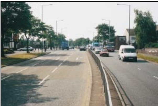
Photograph 37.3: A signal-controlled junction on a district distribution road.

37.1 provides only a first estimate of the suitability of a particular layout. It does not take into account the pattern of movement through the junction, particularly the proportion of right-turning traffic or variations in the geometry of junction layout. For these reasons, undue reliance should not be placed on this Figure for design purposes.