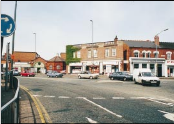
Photograph 37.2: An urban roundabout.