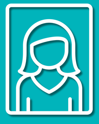
Head and Shoulders Photo