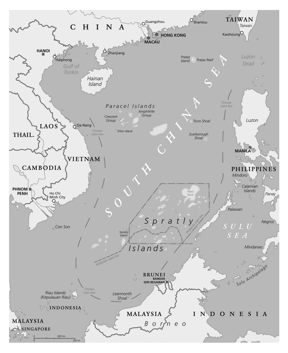
Map 9.1 South China Sea Islands

Comment: There is no evidence to support China's historic claims. Chinese cartographers only began to lay claim to the islets and maritime domain in the South China Sea in the 20th century. The official ROC map was issued in 1947 and the relevant documentation is located undisclosed in Taipei.