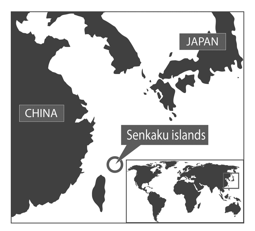
Map 6.1 The Senkaku/Diaoyu Islands

These developments inflamed nationalist sentiment on both sides. A pattern developed by which Chinese boats caught fishing in the EEZ of the islands would