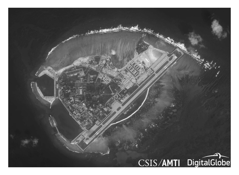
Figure 5.1 Aerial View of Woody Island

Xi Jinping's assertiveness is accentuated by the contrast between his emolument words and speeches about cooperative security and his coercive diplomacy in handling disputes with neighbors and in managing BRI projects, where, as we have seen, Chinese interests are pursued at the expense of those of the resident state. If the last two years of Hu Jintao's term in office were characterized by a pause in Chinese attempts to exercise control over the South China Sea, Xi Jinping's first two years saw a rapid escalation of attempts to impose a new security order in the SCS without even informing, let alone consulting the littoral states in advance. In 2013–14 heavy dredges were brought in close proximity to the seven rocks and shoals occupied by China in the Spratlys, sand and coral was brought up from the sea bottom, deposited over these islets and cemented over. Within two to three years, over 3,200 acres of ground were laid out and various military bases were built upon them, including at least three runways for heavy bombers and another three or four for lighter advanced fighter planes. Deep-water ports were built, as were hangers, barracks, different kinds of missile silos, advanced radar