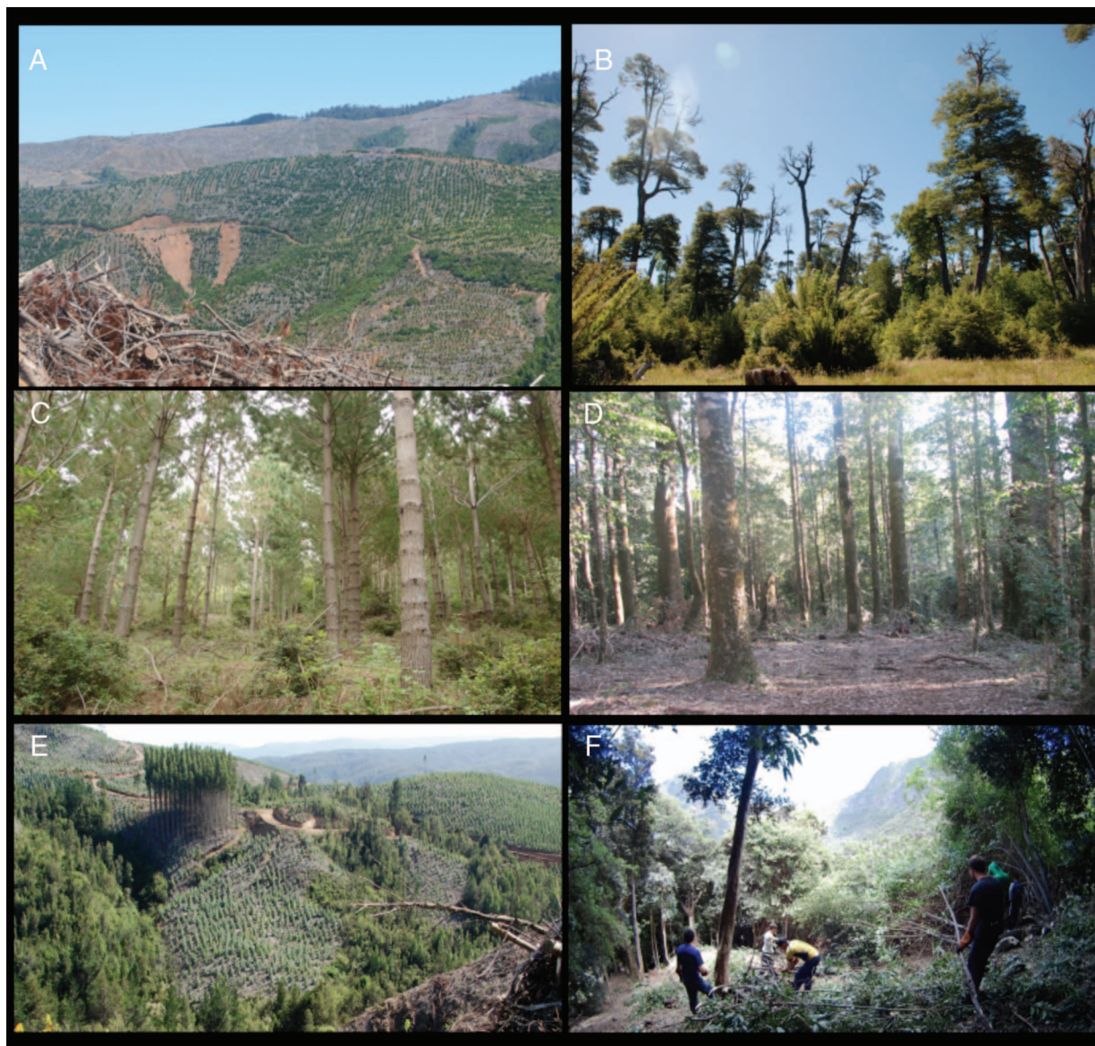
Figure 3. View of a typical clearcut in the landscape (A) and a high graded native forest in the Andes of southcentral Chile (B), a managed plantation of radiata pine (C), a stand of evergreen forest type under uneven-aged management (D), a plantation of well-managed Eucalyptus nitens in the Chilean Coastal Range, stream buffers with protection of native vegetation (E), and invasive species management for restoration to conserve the endemic forest of Robinson Crusoe Island (F).

for long-term management of these forests (Cubbage et al. 2007, Nahuelhual et al. 2007). The Chilean government, during 2008, approved a forestry law that would give some economic support to landowners willing to manage their natural stands under a sustainable framework, but its application has been negligible because of the small amount of the subsidies.