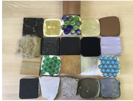
Fig. 1. Twenty-one items with different textures used in the study (from left to right: brick, granite, glass, glass seashells, plasticine, leather, fur, sponge, rubber, velvet, silk, wood (spruce), acupressure mat, wooden block, tile, glass pebbles, sandpaper, marble, concrete, toy slime, clay).