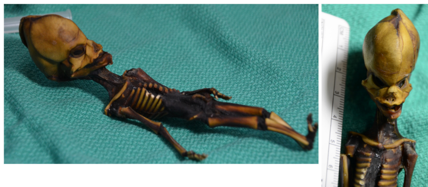
Figure 1. Mummified specimen from the Atacama region of Chile. Representative photograph of the 6-in skeleton (left) and frontal view of the skull of the Ata specimen (right).

genetic ancestry and sex determination, identification of disease- and phenotype-associated genes, and novel single nucleotide variation (SNV) detection.