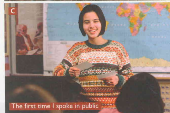
The first time I spoke in public